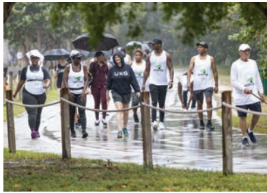
Walking with Friends!