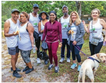
Miller Construction team enjoying the after party!