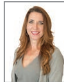
JaCinda Carey Seacrest Pools