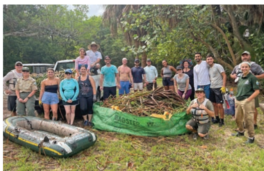
Emerge Broward volunteer group showing off their day's work!

clogged by invasive cattails and hydrilla that limited access for kayaks, canoes and our monthly water resource treatments. Leading up to the project, volunteer groups have come on kayaks to manually pull cattails from the lake. Phase 4 is scheduled for 2024 and will address the inner sections of the lake, including the areas east and west of the island. We all look forward to a more navigable lake.