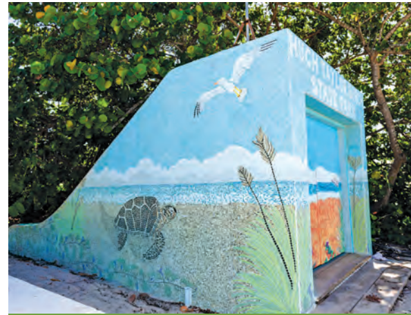
Beach Tunnel Entrance Mosaic

Come visit the Park and cross over either through the tunnel or on A1A to the beach. Take a photo of you and your friends or family in front of the mosaic, send it to us and we'll put it up on our website and Facebook.