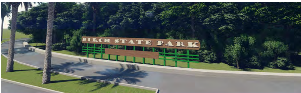
Above: Original park sign corner A1A and Sunrise Blvd. Below: Rendering of planned Hugh Taylor Birch State Park sign