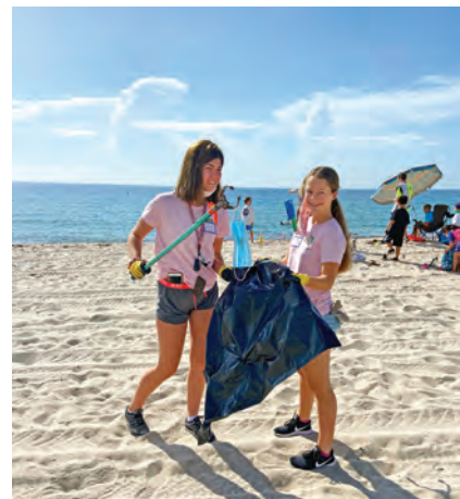
Debutantes clean Fort Lauderdale Beach adjacent Birch State Park