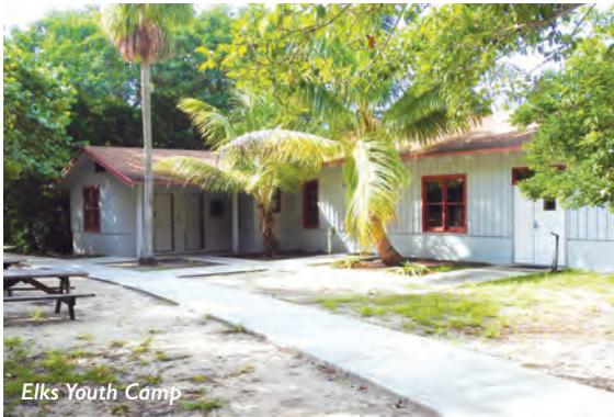
Elks Youth Camp

While Covid19 cancelled our fundraiser for the renovation of the 70-year-old Elks Youth Camp the day before the event, we are moving forward with plans to renovate the Camp.