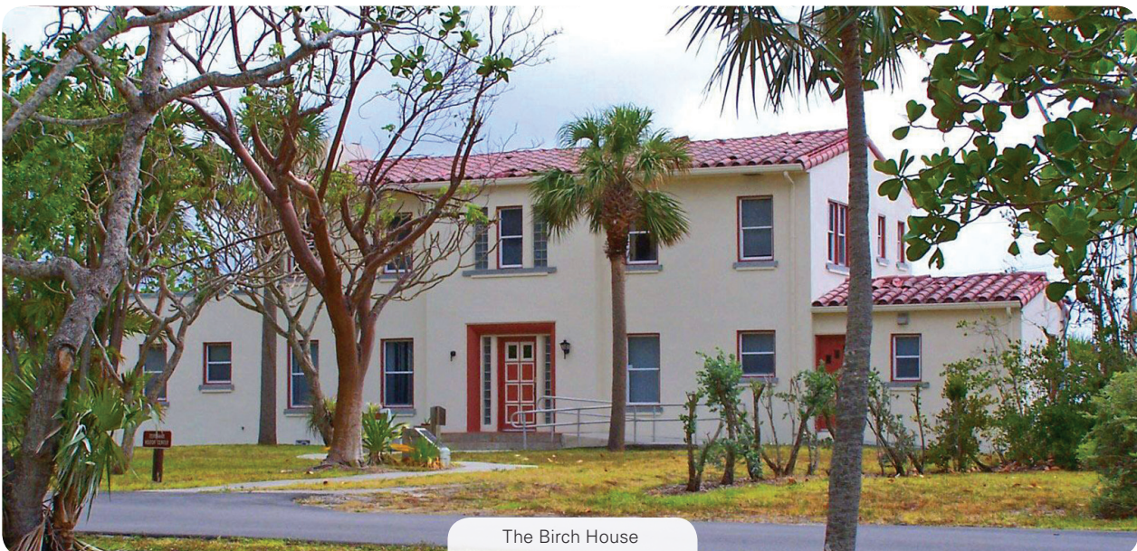
The Birch House