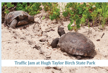
Traffic Jam at Hugh Taylor Birch State Park

Friends prides itself on conserving Birch State Park for future generations without forgetting the relevance of remembering the past. We love and appreciate all the memories created and feel they should all have a place to be commemorated!