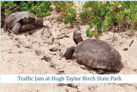
Traffic Jam at Hugh Taylor Birch State Park

Friends prides itself on conserving Birch State Park for future generations without forgetting the relevance of remembering the past. We love and appreciate all the memories created and feel they should all have a place to be commemorated!