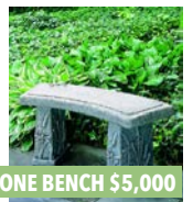
STONE BENCH $5,000