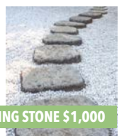
STEPPING STONE $1,000